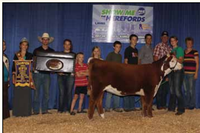
L3 Lady Gear 328 — 2013 Junior National Division Champion Granddaughter of Reference Dam E