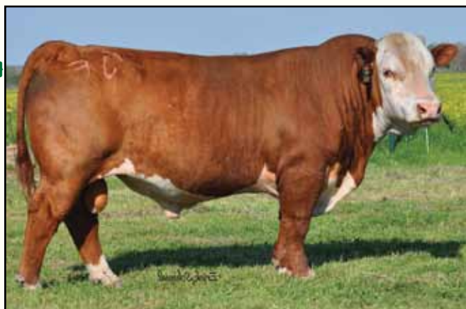
Reference Sire D — NJW 98S R117 Ribeye 88X ET