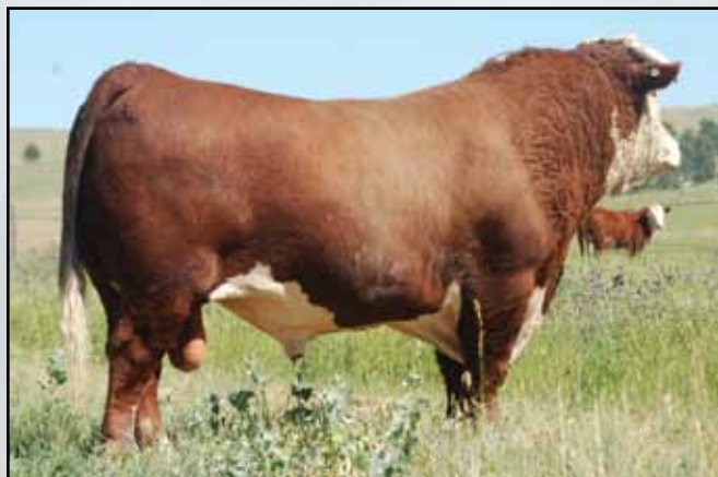
Reference Sire A — L3 Winn Rambo 851