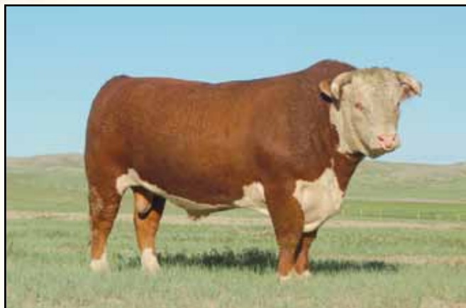
Reference Sire C — Desert Comfort 037