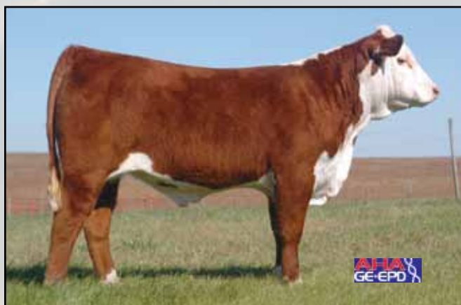
Reference Sire B — STAR L3 Gerber Vision 053